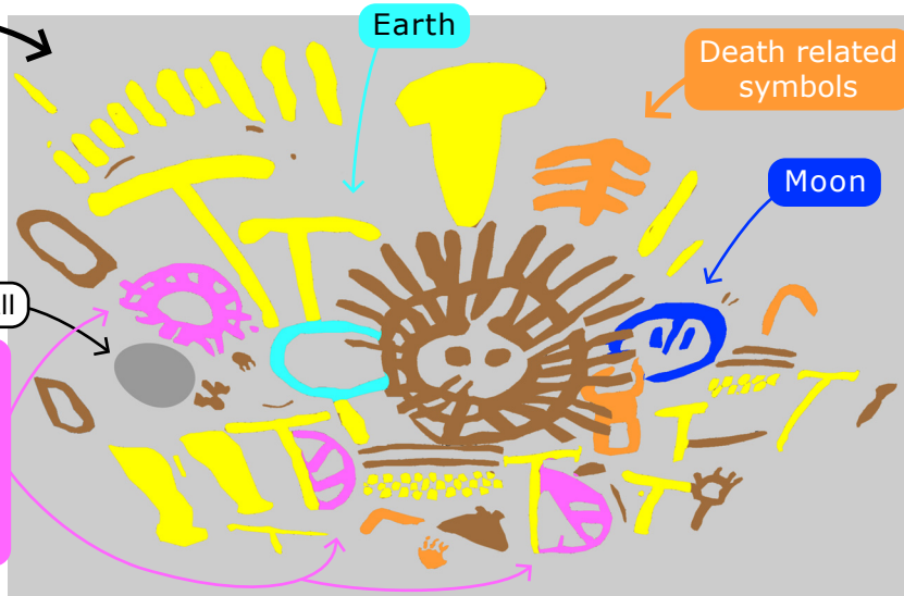
Main Panel 1 - The Pacific Drop (Great Flood), cosmic depiction

Possible depictions of the changes in the seasons, during this event, since it slow down the Earth's rotation and increase its volume, changing our atmosphere.