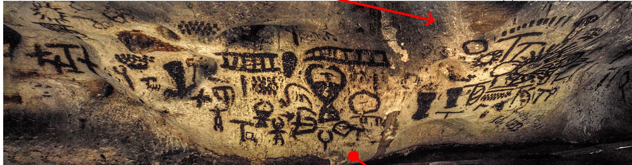
Main Panel 2 - The Pacific Drop (Great Flood), ground depiction