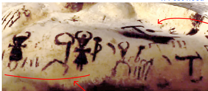
4. Post flood

The T shape to the left of the circle, symbolizing the passing of the Pacific Drop, a post flood depiction, followed by happy Icons,