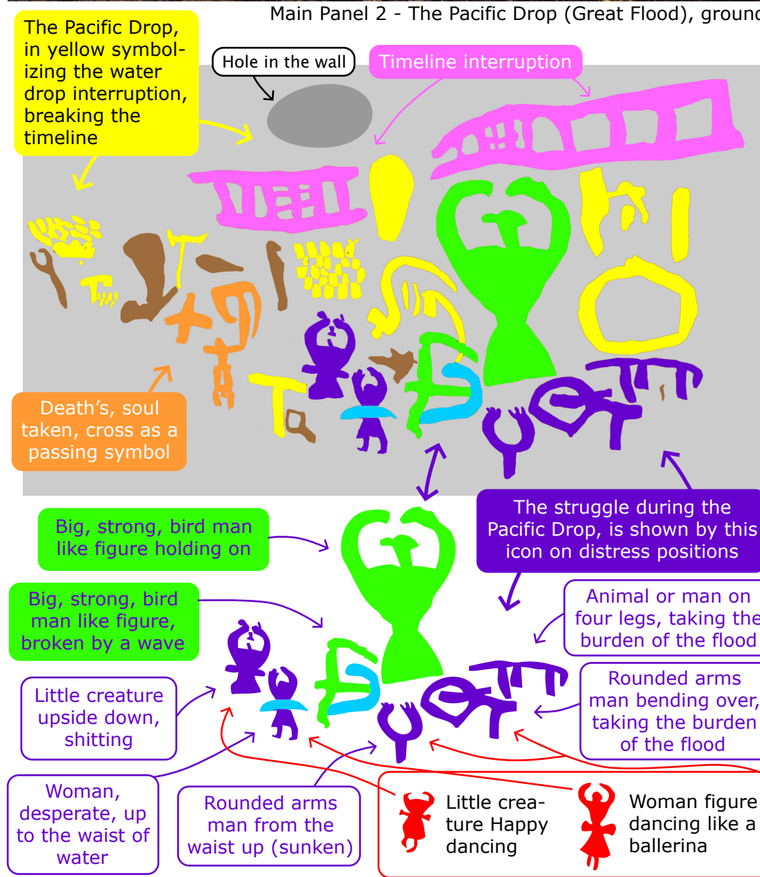
Main Panel 2 - The Pacific Drop (Great Flood), ground depiction